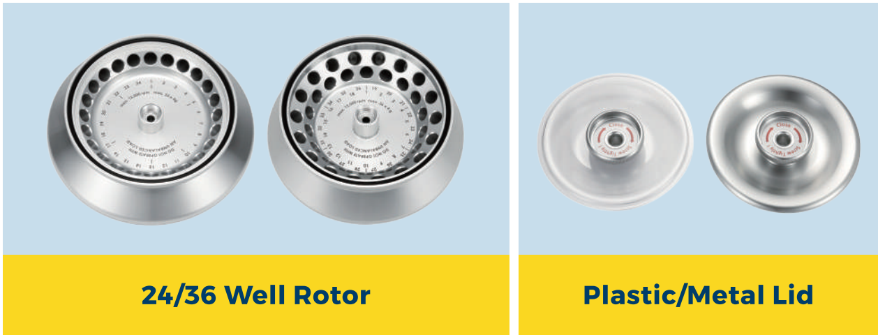
24/36 Well Rotor

Fitted with interchangeable 24- and 36-well rotor options, TurboFuge can accommodate more tubes within the same compact device. The aerosol-tight metal rotor lid option is also available.